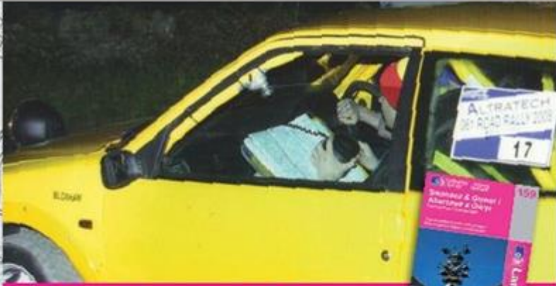
Basic Roamer 5® 1:50 000 scale