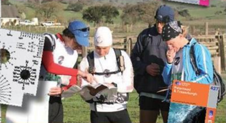
Basic Roamer 6 v2® 1:25 000 & 1:50 000 scales