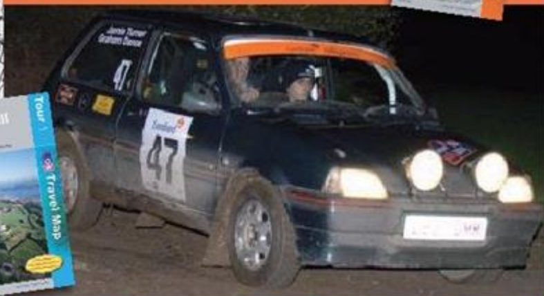
Basic Roamer Endurance® 1:100 000, 1:50 000 & 1:63 360 1in/mile scales